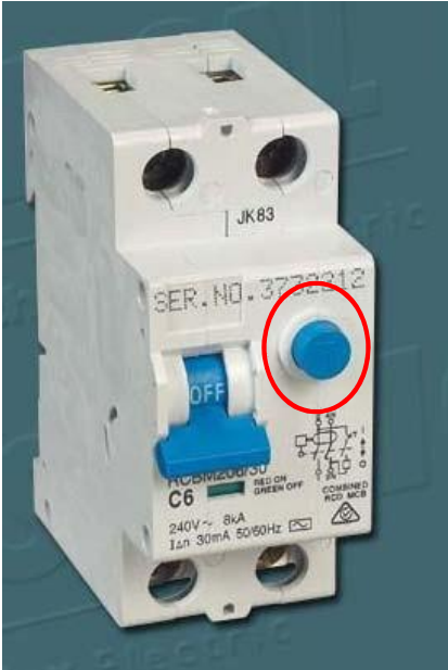
This is what an RCD in your fuse box will look like. Note the “T” or “Test” button